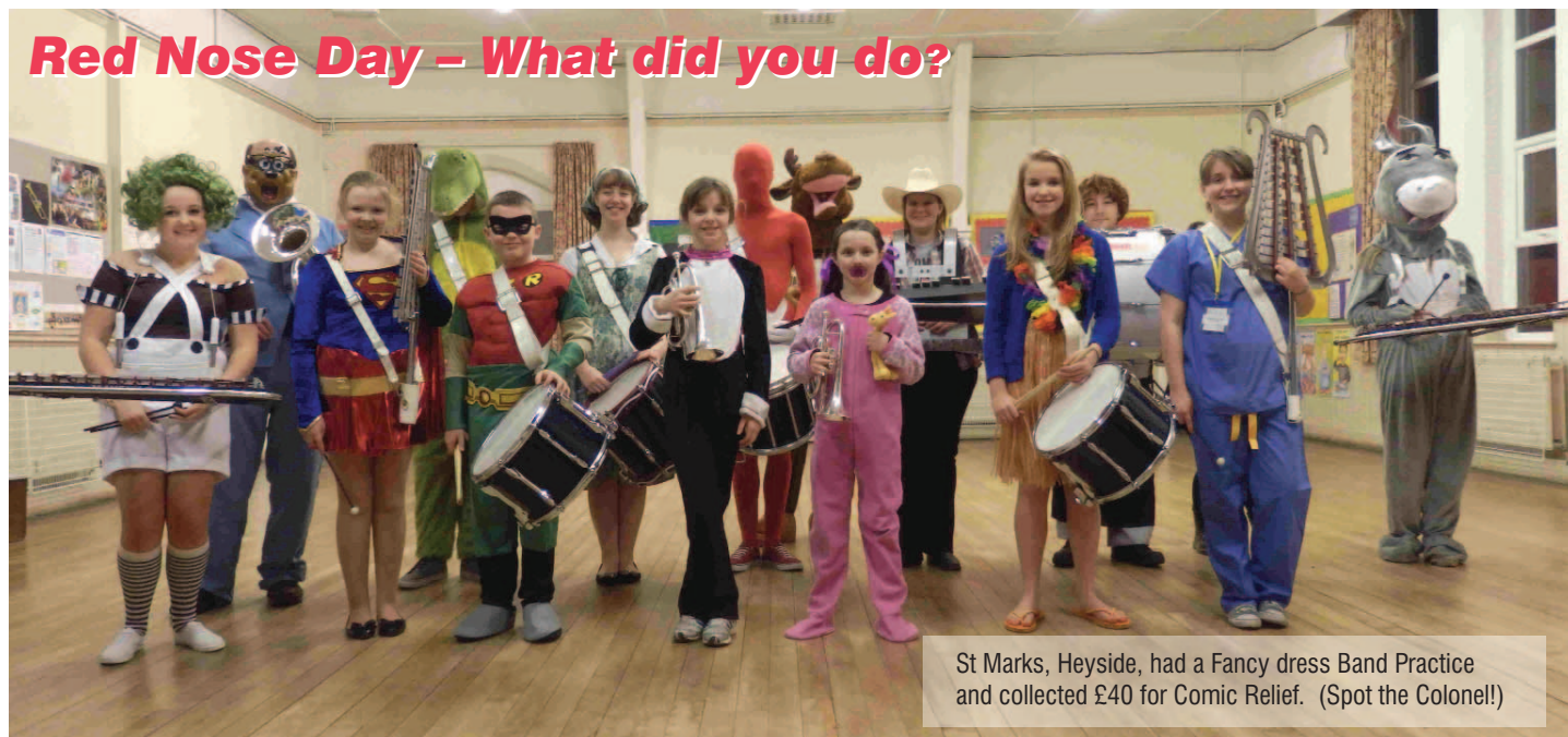
St Marks, Heyside, had a Fancy dress Band Practice and collected £40 for Comic Relief. (Spot the Colonel!)