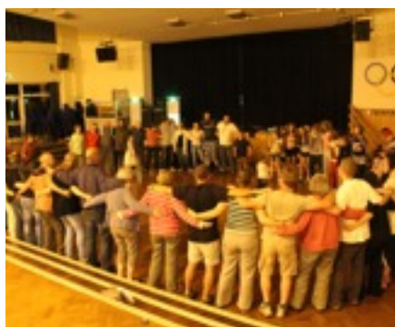
Last night Camp 2012 Troutbeck Bridge

We look forward to welcoming you to NE Camp 2013