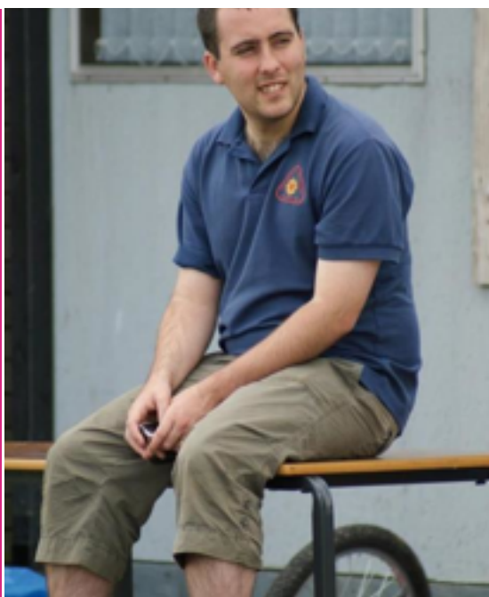
Teamwork in action