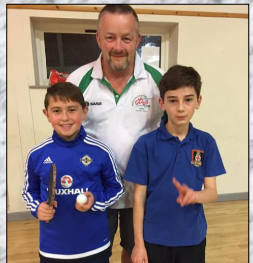
Table Tennis - Some of the competitors who took part in the 1 st /3 rd Battalion Table Tennis Competition