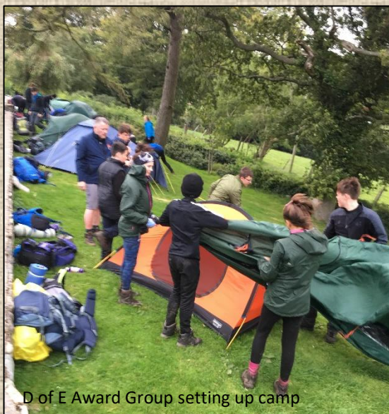
D of E Award Group setting up camp

Athletics - Saturday 2nd June 2018, Antrim Forum