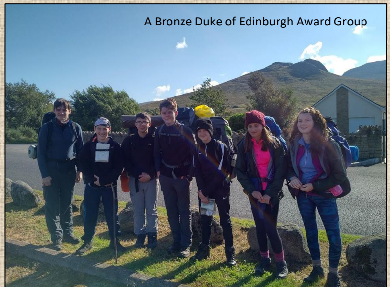
A Bronze Duke of Edinburgh Award Group